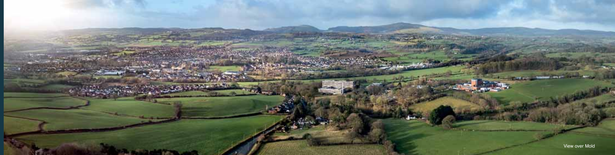
View over Mold

There's also the North Wales coastline to explore. Talacre Beach has miles of wind-swept golden sandy beach, beautiful dunes and the iconic Point of Ayr Lighthouse which dates back to 1776. For a more traditional family seaside trip, there's Prestatyn, Rhyl and Llandudno, with each offering its own unique charm and character. If you'd prefer a city trip, Chester is only 25-minutes by car. Ideal for taking in the many shops, rich history, café culture and seemingly non-stop entertainment.