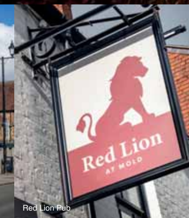
Red Lion Pub