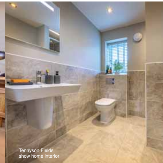
Tennyson Fields show home interior