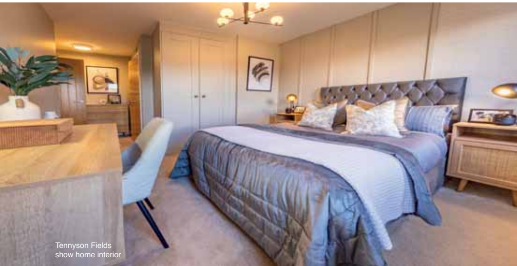
Tennyson Fields show home interior