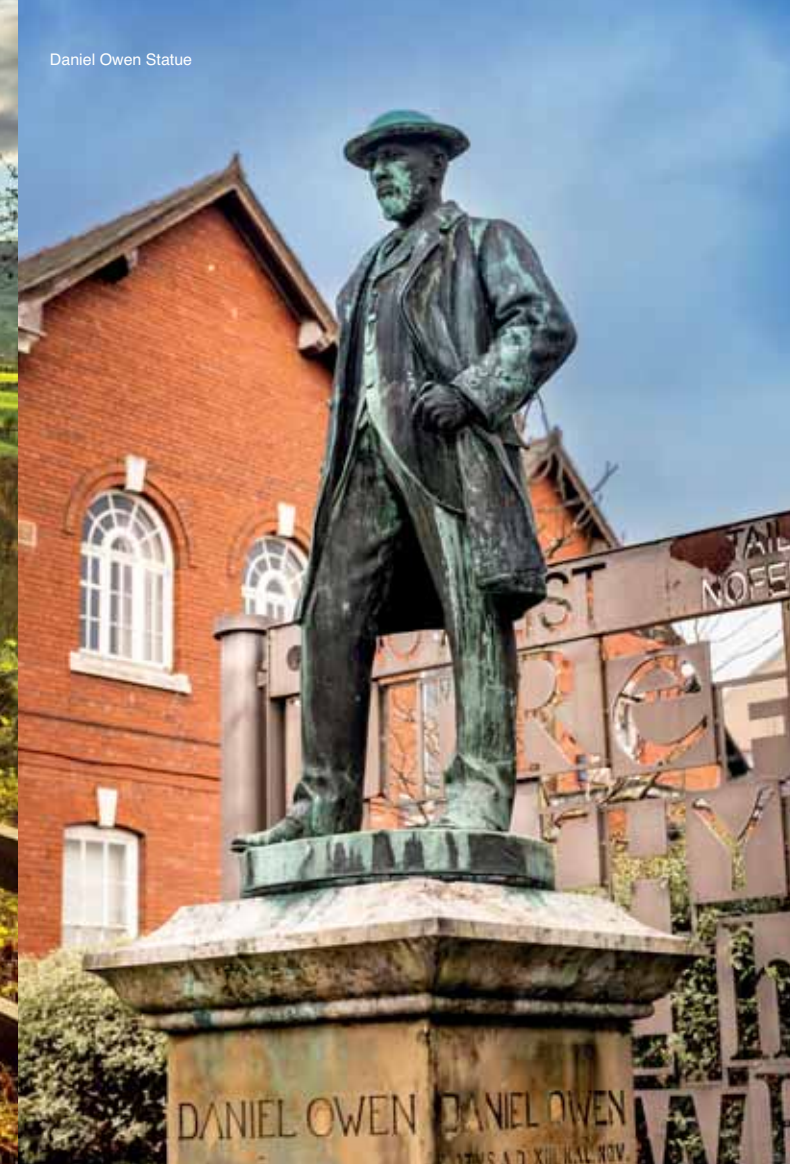
Daniel Owen Statue