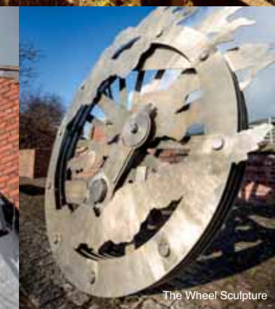
The Wheel Sculpture