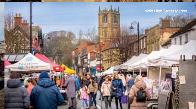
Mold High Street Market