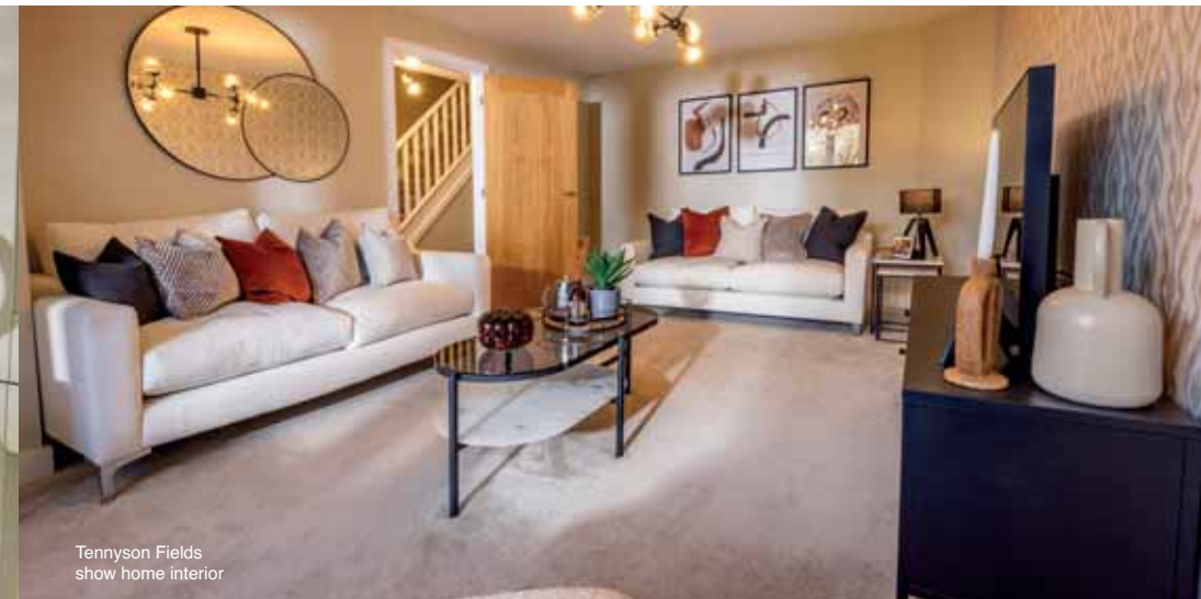
Tennyson Fields show home interior