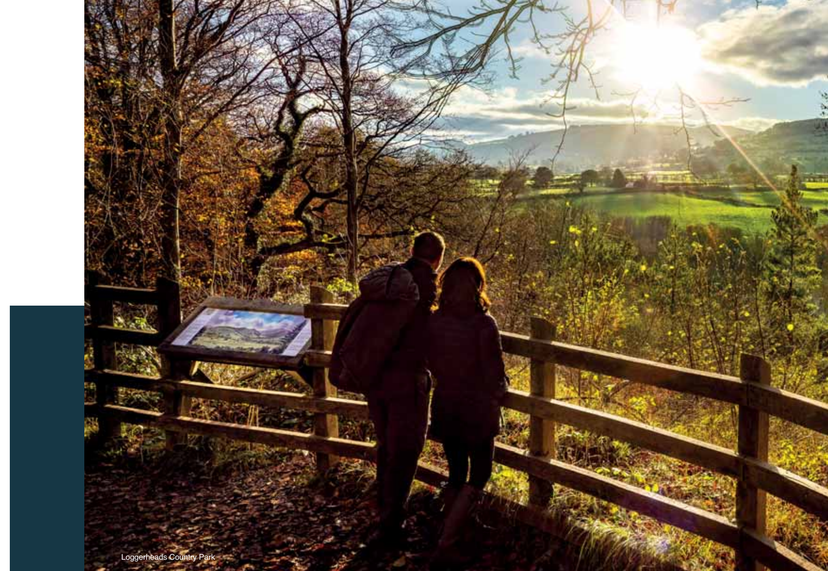
Loggerheads Country Park

Finally, you're going to need a new diary for Mold's wide range of events. These include an annual Food and Drink Festival, the biggest carnival in Flintshire and an eclectic mix of music festivals such as Live on the Square, M-Fest and the North Wales Blues and Soul Festival.