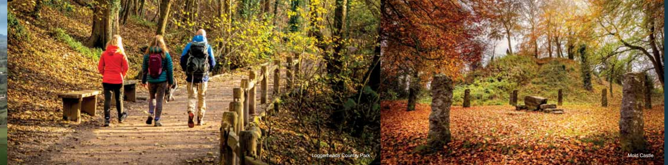
Loggerheads Country Park