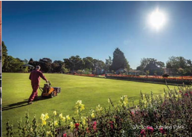
Victoria Jubilee Park