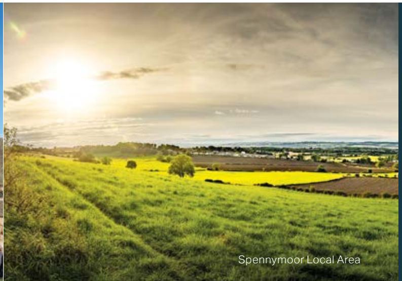
Spennymoor Local Area