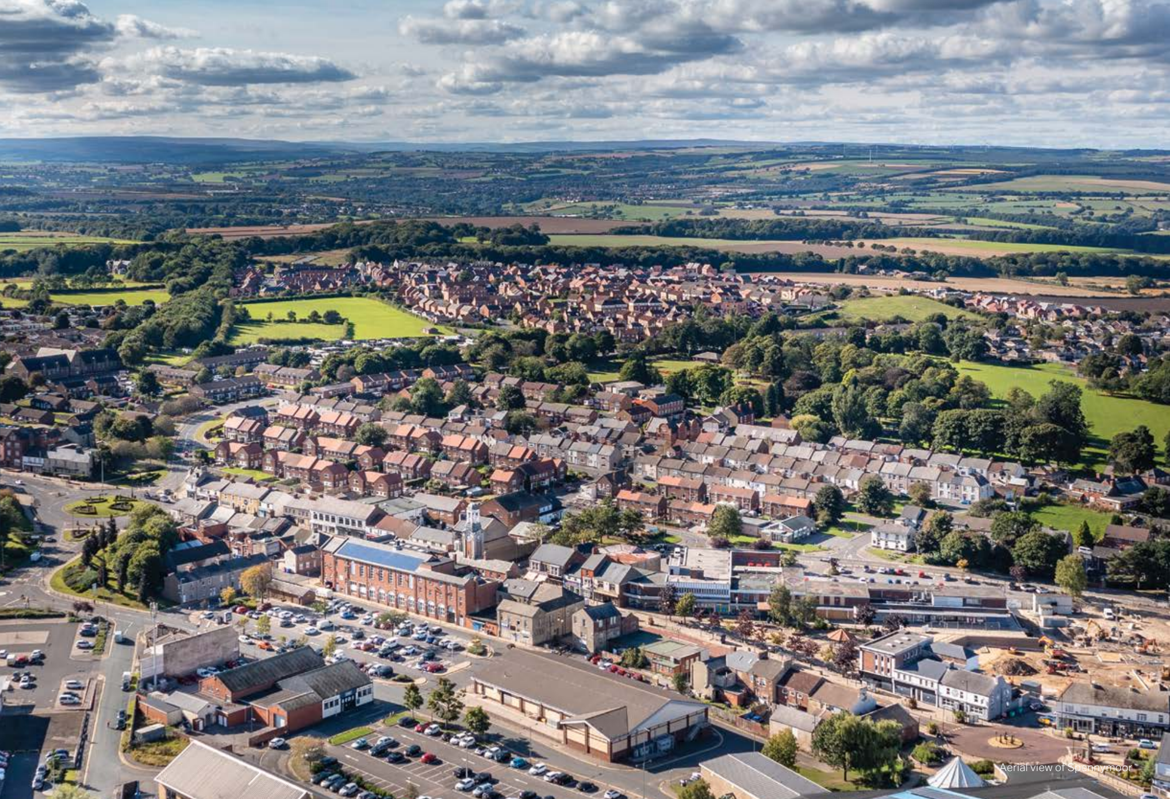
Aerial view of Spennymoor