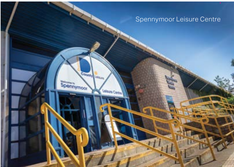
Spennymoor Leisure Centre

Barnard Castle, an attractive market town south west of Spennymoor, is host to the Bowes Museum, built specifically to house a stunning, private art collection including an automaton silver swan which was acquired by John Bowes, the museum's founder, from a Parisian jeweller in 1872. The Beamish Museum, an outdoor museum celebrating the North East's urban and rural history is close by, as is Whitworth Hall, originally owned by Robert Shafto, famously commemorated in the folk song 'Bobby Shafto's Gone to Sea'.