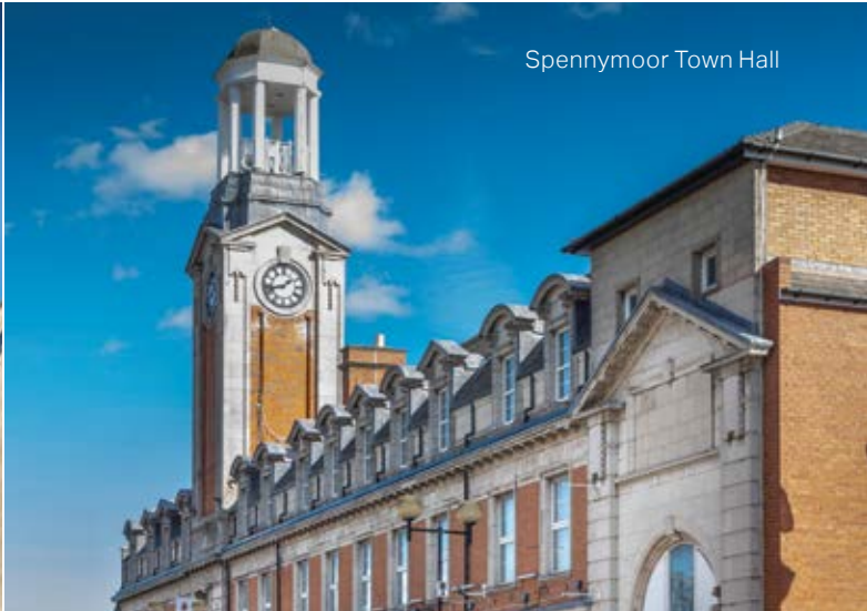
Spennymoor Town Hall