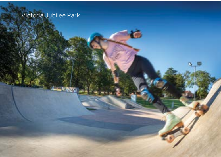
Victoria Jubilee Park