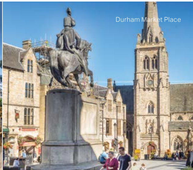
Durham Market Place